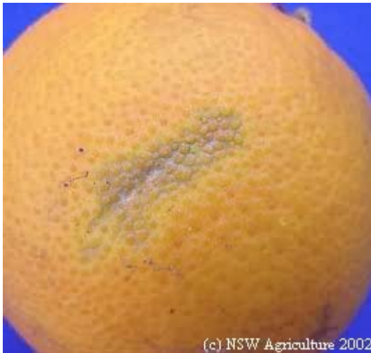
Photo 1. Oleocellosis development on a Washington navel orange which has been highlighted when it was degreened.

Oleocellosis is the unsightly damage to citrus fruit rind caused by the release of oil from damaged oil glands. It has been traditionally referred to as a 'burn' caused by the released oil. It is more prevalent when wet cold fruit are picked and the oil glands easily ruptured as a result of finger and impact pressure. The released oil damages the rind and within 2 to 3 days an unsightly blemish develops. It is particularly a problem with gas ripened or degreened fruit where the damaged surface does not change colour and remains green. This stands out as a very unsightly blemish against the background of the orange coloured rind (photo 1). On close examination of the affected surface it can be seen that it has become roughened as a result of the tissue around the remaining glands sinking, (photo 2).