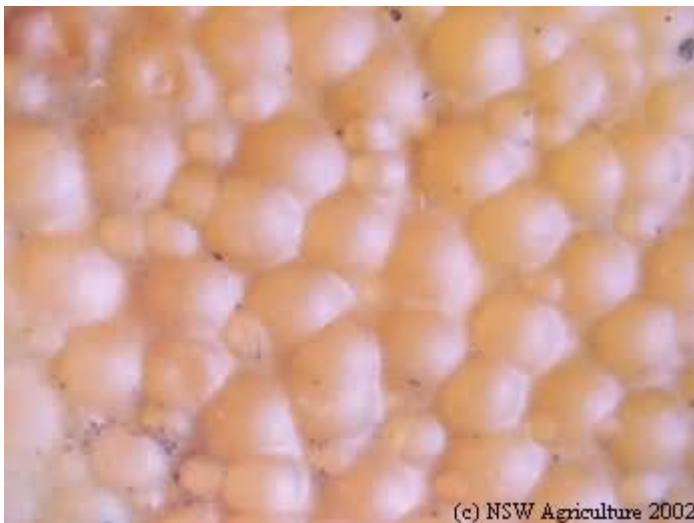
Photo 2 & 3. Close-up view of the surface of an oleocellosis affected orange. Note the depressed area around the remaining oil glands.