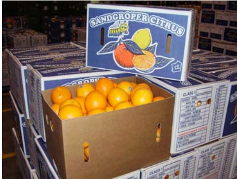
▲ New season WA Navels

There was a lot of interstate fruit in the markets this month and little fruit from WA. The first of the WA navels arrived late in the month; fruit was loose filled and looked good (see photo). Some navels from SA were also loose filled. One batch of red flesh grapefruit from Kununurra was incorrectly packed with fruit loose and not filling the carton. This may cause problems with rind damage during transport. Composite packs of grade one SA navels available in the markets didn't look good next to grade one Californian navels (see photo).