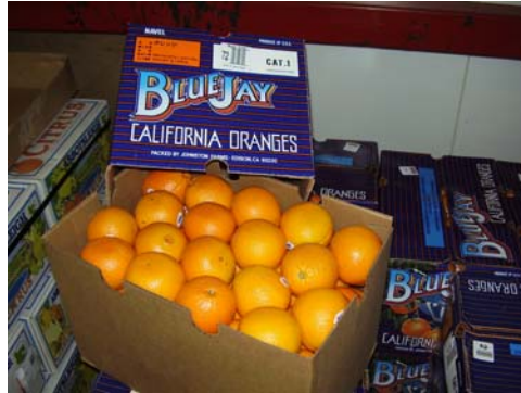
▲ Californian Grade 1