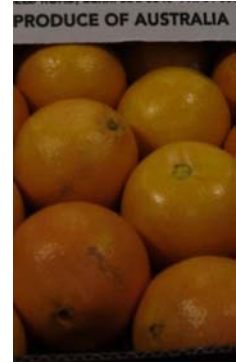
▲ SA Grade 1